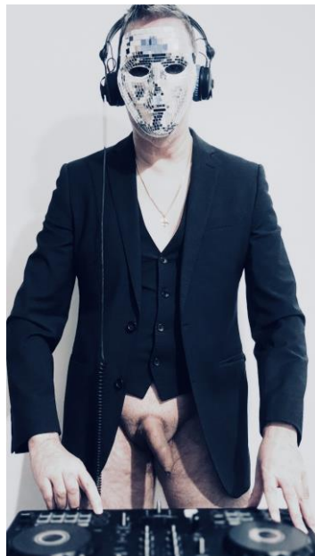
Performance Shot 1